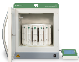
Figure 1 – Milestone's ETHOS X with SR-15 eT rotor